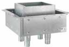
CFB7G6FRK Kit with CFB7G6