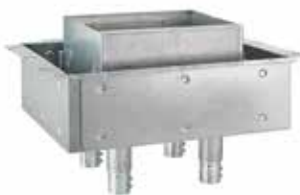
CFB11G6FRK Kit with CFB11G6