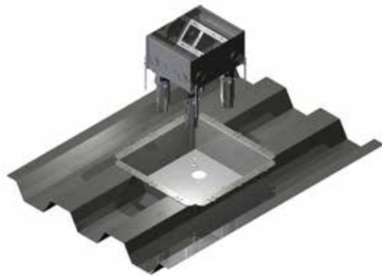
CFB7G6 Floor Box above CFB7G6FRK Installed in decking